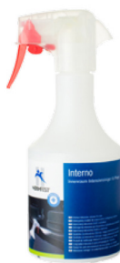
Interno Interior Cleaner