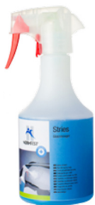
Stries Glass Cleaner

lowme@eurocarparts.com Cisco: 7001 – 066