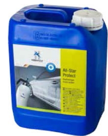
All-Star Protect Power Cleaner