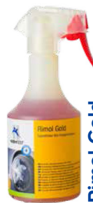
Rimol-Gold Acid Free Wheel Cleaner